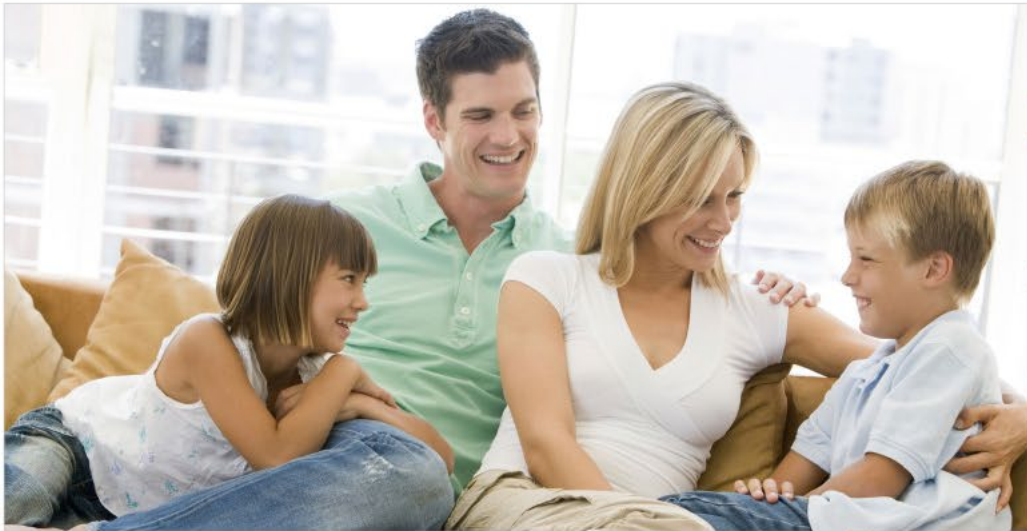
Moving is a family project

The check list at the end of this brochure will give you a brief overview of the most important things to do before, during and after the move. We must emphasize that these guidelines do not claim to be exhaustive, but we hope that the information compiled here will give you some ideas. For further information, addresses and tips about moving with children, please also check the internet which offers a wealth of information.