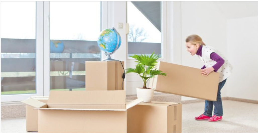
Let your kid actively help in the move

Once all boxes labelled "child's bedroom" have been emptied, parents are able to breathe more easily again. Your child is busy and you can pay attention to the countless other boxes. However, try to keep to your usual routine, such as lunch and dinner times or bedtimes. Children love routine. Try to find some time for a break in between to explore the nearest playground with your child.