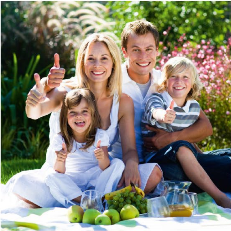
Moving with kids